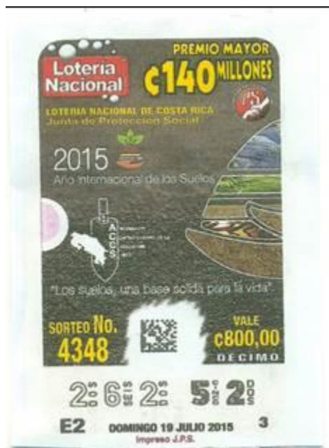
Lottery Coupon, Costa Rica.

In Costa Rica had place a Photo Contest for young from 13-18 years old ( http://www.radio16.com/2015/01/26/concurso-de-fotografia-jovenes-capturaran-imagenes-de-suelos-ticos/ ), a Lottery Ticket, and the VIII National Congress of Soil held from 18 to 20 March, with the participation of about 250 professionals. Closing the IYS, in Costa Rica will be held the activity “Hands to the ground” (“Manos al suelo”), where the aim is to teach how to conserve 1 m 2 of soil.