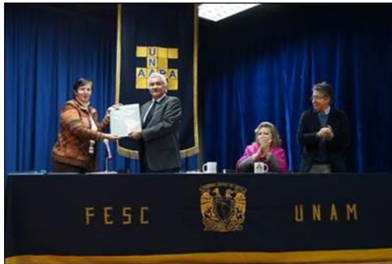
Atlas of the Soils of Latin America and the Caribbean" in Cuautitlan FES-UNAM, Mexico

Change. December 5 of 2014; 4) Delivery of Calendar "2015 International Year of Soils" and "Atlas of the Soils of Latin America and the Caribbean" in Cuautitlan FES-UNAM, February 18, 2015; 5) Symposium "The Geography of the International Year of Land". March 23, 2015, organized by the Faculty of Philosophy and Letters, UNAM; 6) Soil, water, life. Supplement of the month "La Jornada Field No. 91 "20 pages devoted to the 2015 International Year of Soils. April 18, 2015. http://issuu.com/la_jornada_del_campo ; 7) National Meeting of Teachers and Researchers of soil science. 18 to 19 of June; 8) National Alliance for the Soil. August 17, 2015. Palace Mining UNAM; 9) Symposium "Inorganic Chemistry in the International Year of Soils". 14 to 16 October 2015. UNAM FES-Cuautitlán; 10) University International Meeting of Soil Science. 4 to 10 October 2015. UNAM Campus Juriquilla; 11) Metropolitan Soil Science Symposium. October 19, 2015 FES-Zaragoza, UNAM.