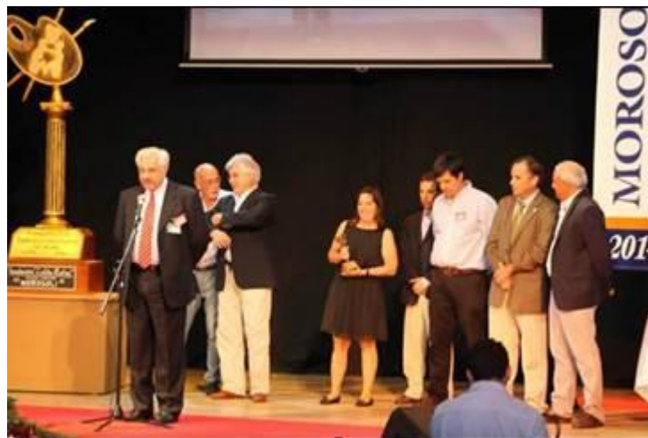
Soil Conservation Program, - University of the Republic, the National Institute of Agricultural Research, and the Ministry of Livestock, Agriculture and Fisheries- was distinguished with an award of the Foundation "Lolita Rubial" Morosoli, December 2014, Uruguay.

In Venezuela the SVCS celebrated of the First World Soil Day, in December of 2014, with school children between 5 and 12 years more than 5 schools. The meeting was held at the Museum of the National Land Agricultural Research Institute (INIA). Moreover, the XXI Congress of Soil Science, organized by the Universidad Nacional Experimental del Táchira, San Cristóbal Edo. Táchira, and the SVCS will be held on 24-27 November.