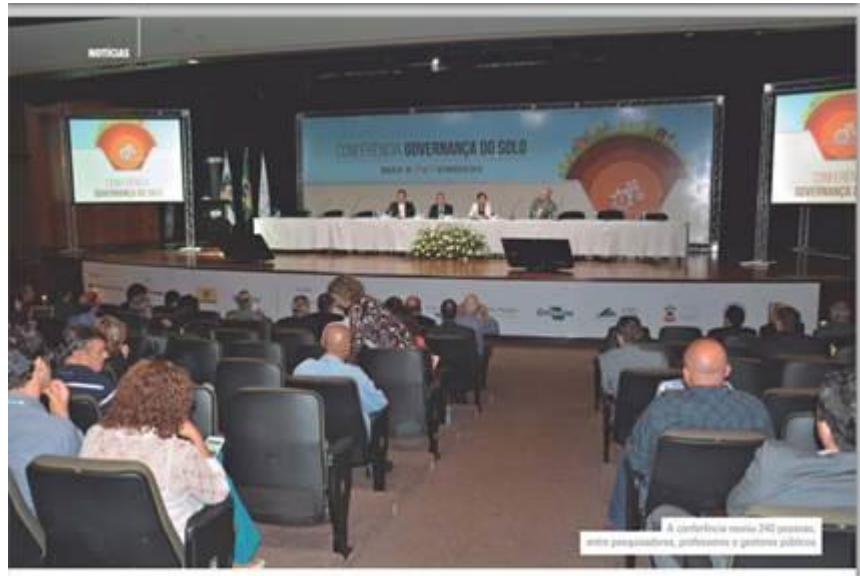
Soil Governance Conference (Brasilia, DF, Brazil).

In Costa Rica had place a Photo Contest for young from 13-18 years old ( http://www.radio16.com/2015/01/26/concurso-de-fotografia-jovenes-capturaran-imagenes-de-suelos-ticos/ ), a Lottery Ticket, and the VIII National Congress of Soil held from 18 to 20 March, with the participation of about 250 professionals. Closing the IYS, in Costa Rica will be held the activity “Hands to the ground” (“Manos al suelo”), where the aim is to teach how to conserve 1 m 2 of soil.