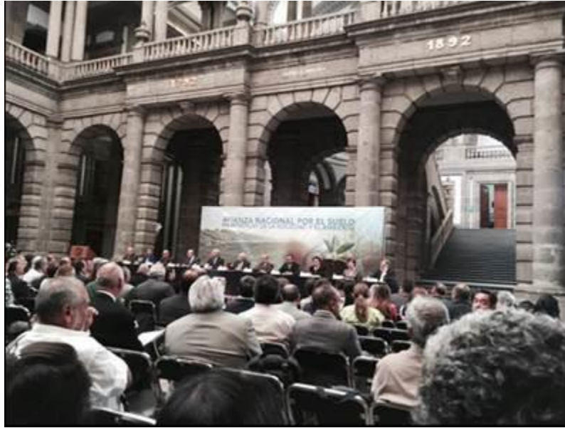
National Alliance for the Soil. August 17, 2015, Mexico.

In Puerto Rico there was a poster competition “Suelos sanos para una vida sana” ( http://suelos2015.eea.uprm.edu/ ).