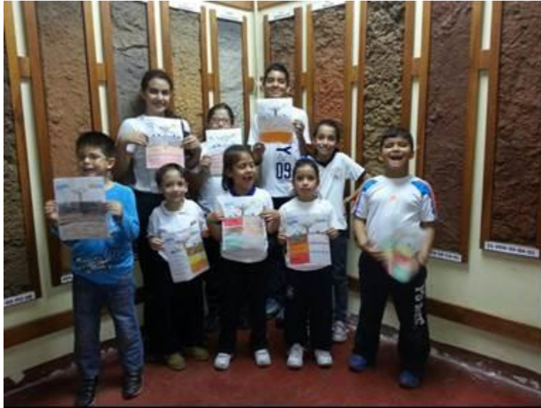
First World Soil Day, in December of 2014, with school children between 5 and 12 years more than 5 schools, Venezuela.

A very remarkable action was performed by the Soil Science Society of Spain (SECS), demonstrating the hard degree of compromise of its members with the mission of the IYS ( http://www.secs.com.es/?page_id=445 ). The SECS and the Universitat of Lleida organized multiple activities through the country, where the participants were the protagonists: a Poster contest allusive to 2015 IYS, an international photography and video contest, a Comics contests, a Prize for the best article in 2015 in the media, moreover of an itinerant exhibition of soils "Soils and Forest Biodiversity", and a documentary "The skin of the world". Further activities of the SECS were the emission of a coupon of the National Organization of Spain Blind (ONCE), with the logo of the IYS included in the coupon.