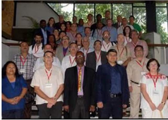
Central America-Mexico-Caribbean Regional Alliance, Havana, Cuba.

The Soil Science Society of Cuba organized a Phonebook 2015 International Year commemorative of the Soil, and in June took place the meeting of the Central America-Mexico-Caribbean Regional Alliance, Havana, Cuba.