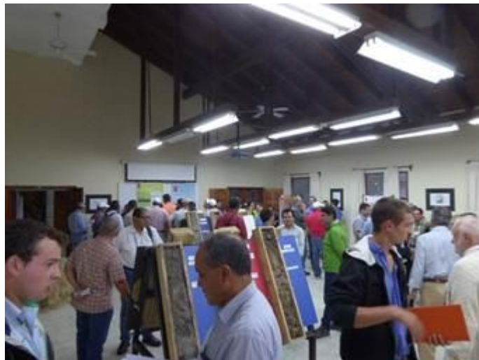
Week of Soils, in Honduras. First meeting of soils, in Honduras.

The Soil Science Society of Mexico organized several activities, such as 1) Contest of posters to the 2015 International Year of Soils ( http://slcs.org.mx/index.php/es/posters-ganadores-del-concurso-estudiantil-unam ); 2) Edition Calendar 2015 International Year of Soils; 3) Symposium "World Soil Day", organized by the National Autonomous University of Mexico (UNAM), Colegio Postgraduate and National Institute of Ecology and Climate