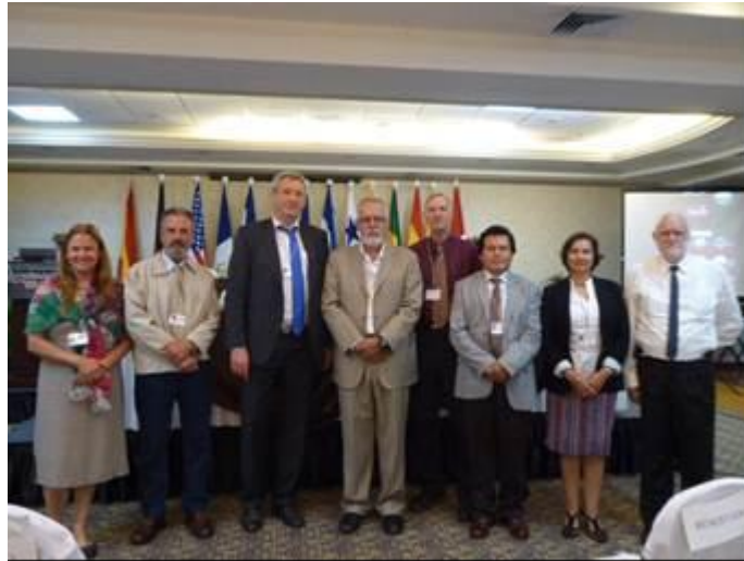
Week of Soils, in Honduras. First meeting of soils, in Honduras.

The Soil Science of Honduras celebrated the IYS with the Week of the Soil ( semanadelsuelo@zamorano.edu ), with distinguished experts, where attended about 480 participants.