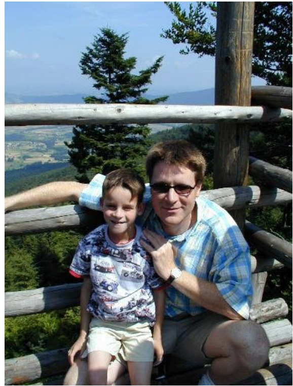
The chairman takes the opportunity to make his son world-famous.

First, the World Soil Congress of the IUSS in Bangkok, Thailand. A more detailed report on the events taking place at this congress is included elsewhere in this newsletter, but two important