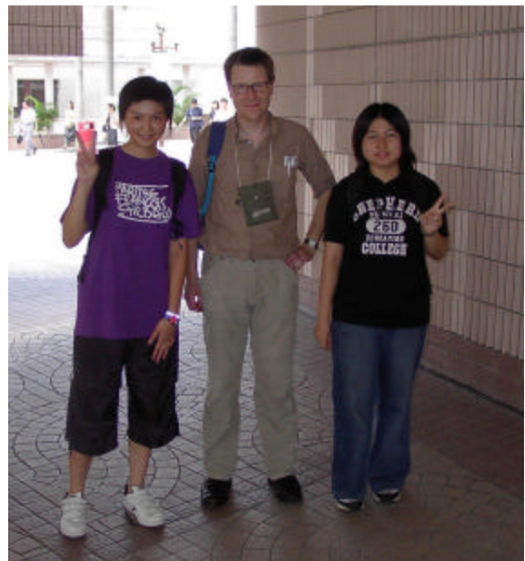
Pedometrics in Asia