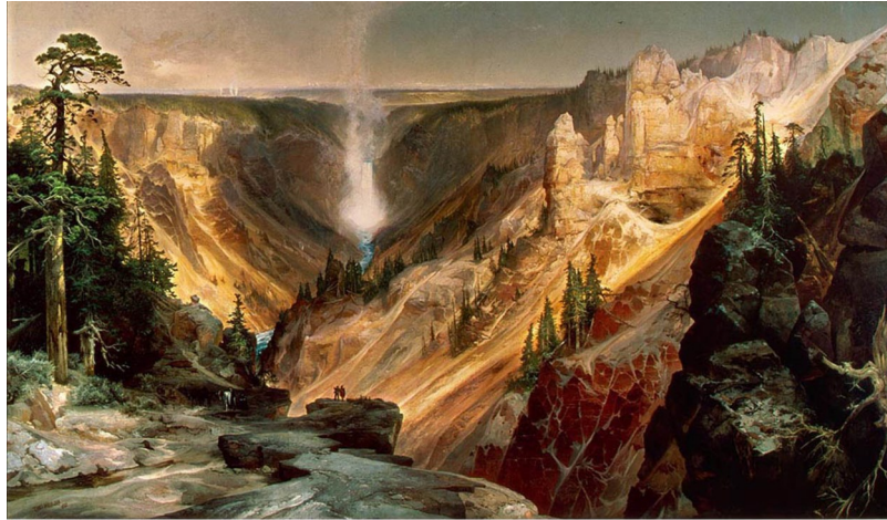
Thomas Moran, Grand Canyon of the Yellowstone , 1872, Department of the Interior Museum, Washington, D.C.

The series of eight webinars will be presented throughout fall 2020 on Tuesdays at 11:00 a.m. ET/8:00 a.m. PT, starting on September 8.